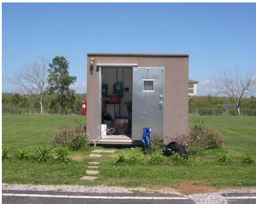
Instrument Shed Housing FTIR Analyzer

The analyzer is based on FTIR (Fourier Transform Infrared) technology. Air is drawn into a sample cell where an infrared beam is passed through. Different molecules vibrate, rotate and stretch differently when exposed to the infrared energy. This leaves distinctive “fingerprints” on the IR detector, and the analyzer’s advanced software is able to simultaneously sort out all the compounds present in the air – and determine how much is there. In addition to providing immediate feedback to facility computers, data can be viewed and the instrument can be remotely controlled, calibrated and updated from remote locations over the internet.