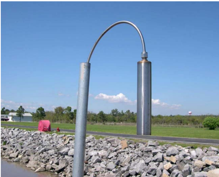
Ambient Air Intake